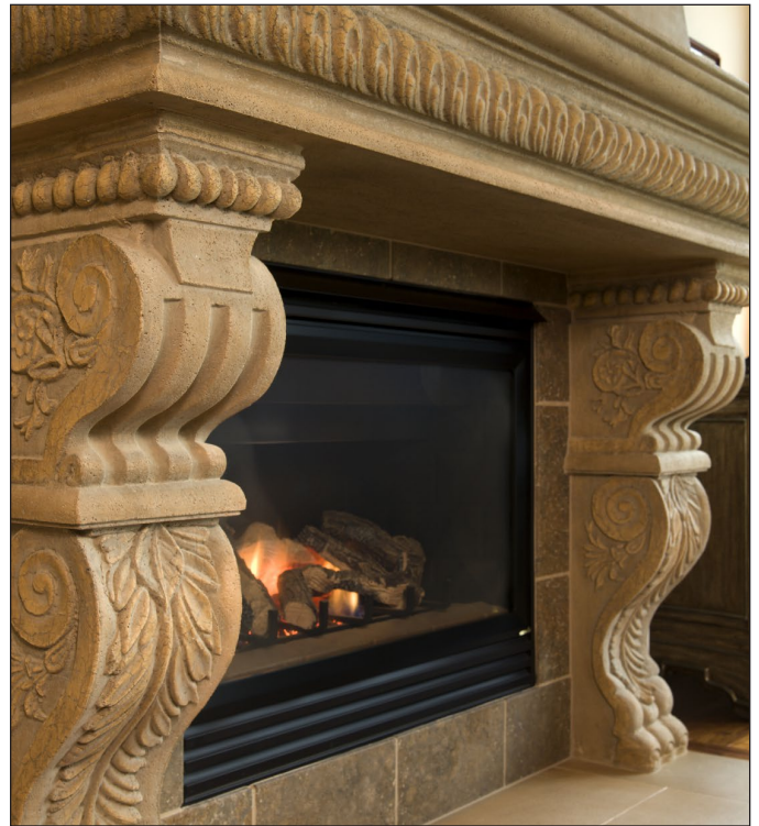
Perlite cultured stone and gas fireplace logs